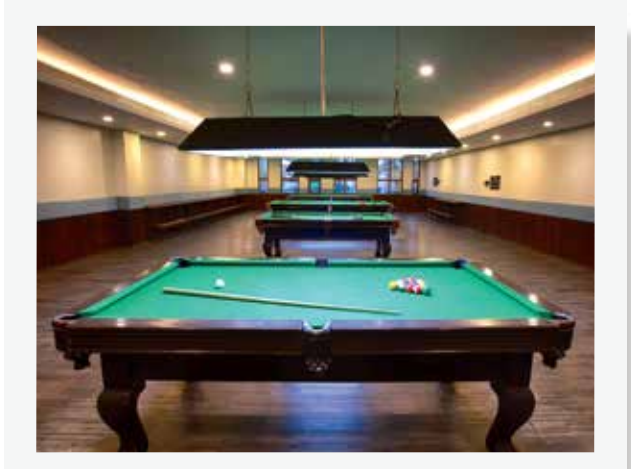
SPEND YOUR EVENINGS HERE AT THE POOL TABLE - ALSO KNOWN AS, THE REAL SOCIAL NETWORK.