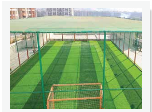
PLAN A DAD VS KIDS FOOTBALL MATCH.