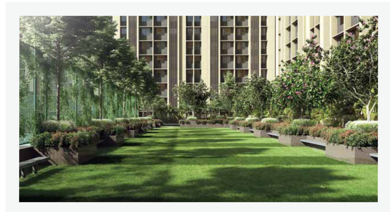
GET YOUR FILL OF FRESH AIR AT THE MULTI PURPOSE LAWN.