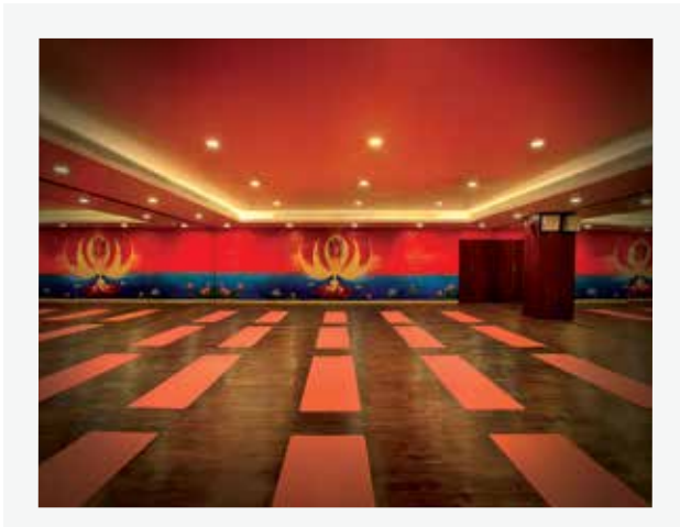
INCH CLOSER TO INNER PEACE AT THE YOGA AND MEDITATION STUDIO.