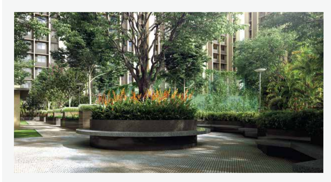
HEAD OVER TO THE SENIOR CITIZENS' PLAZA TO DISCUSS LIFE, THE UNIVERSE AND THE MERITS OF CUTTING CHAI.