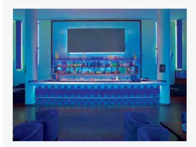
INVITE THE WORK GANG OVER FOR HAPPY HOURS AT THE BAR.