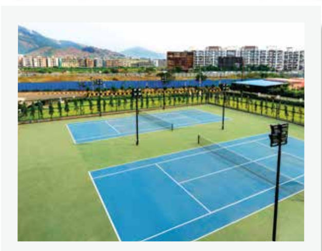
SCORE MAJOR POINTS WITH YOUR BOSS OVER A GAME OF TENNIS.