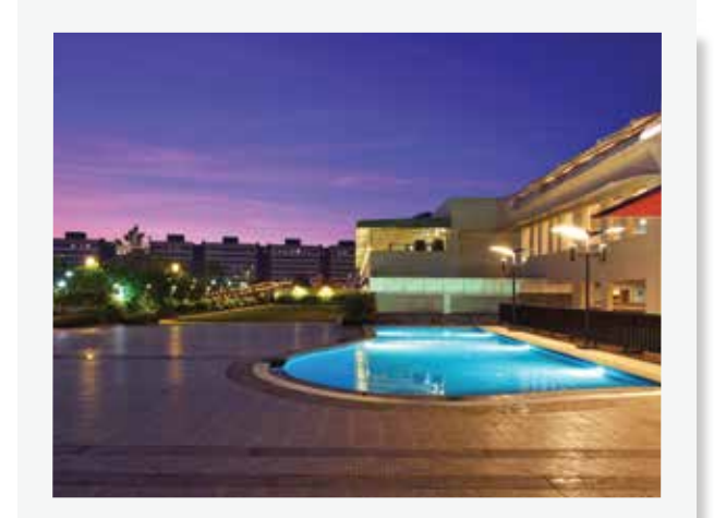
HOST A FAMILY REUNION AT THE PARTY LAWN.