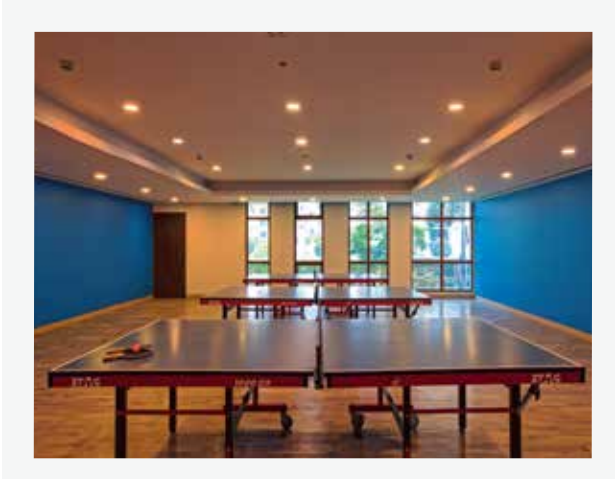
RELIVE THOSE COLLEGE RIVALRIES OVER ENDLESS TABLE TENNIS MATCHES.