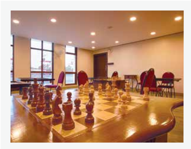
SETTLE BETS WITH FRIENDS OVER CARROM AND CHESS.