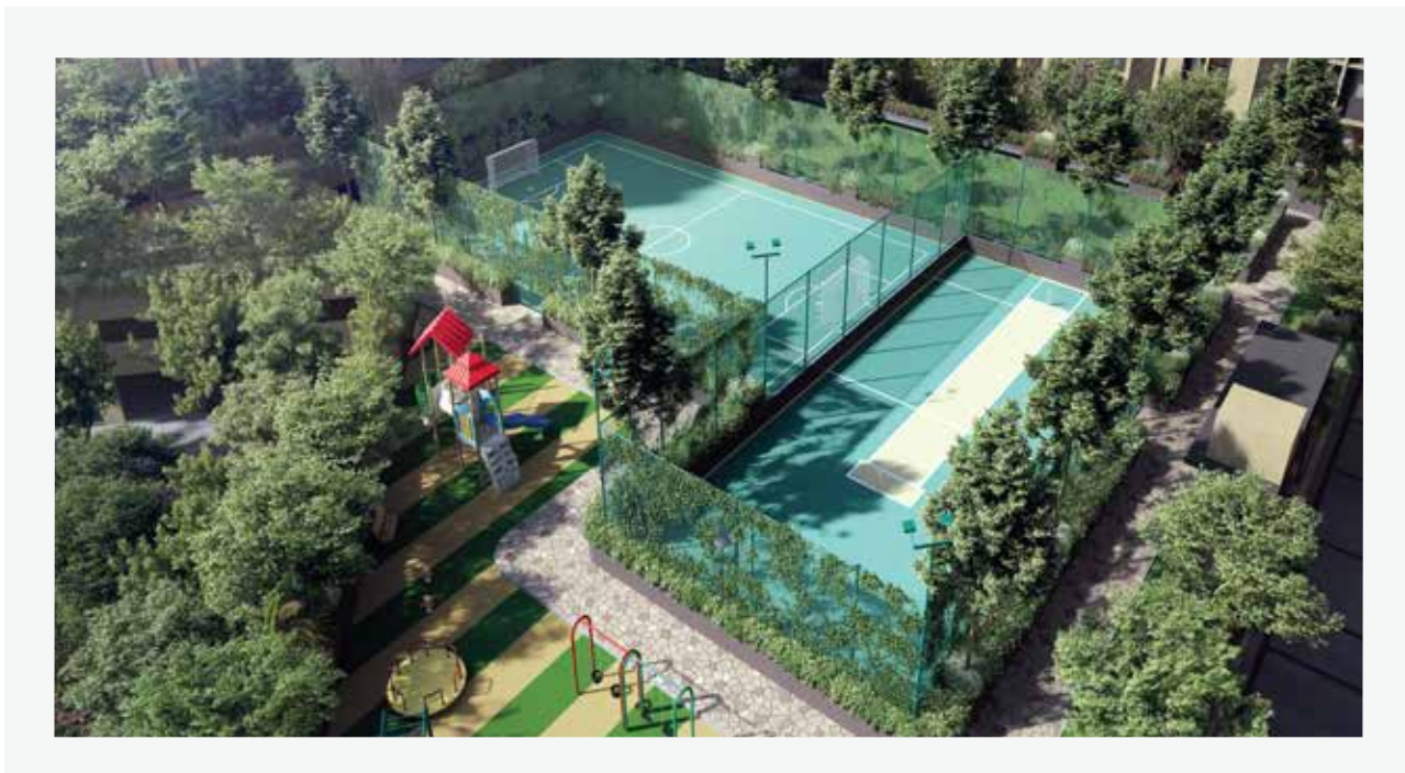
SETTLE THE FUTSAL VS BOX CRICKET DEBATE FOR THE EVENING.