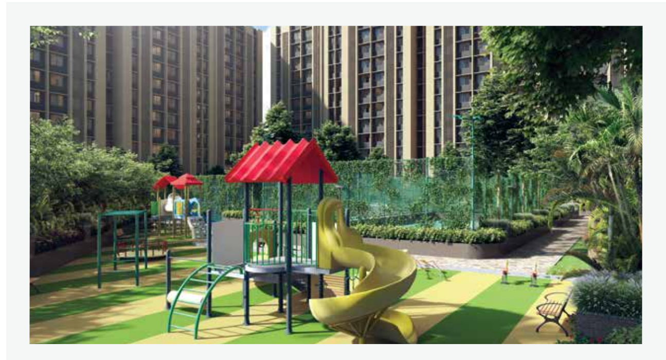
ENTRUST BABY SITTING DUTIES TO THE SLIDES AND SWINGS AT THE CHILDREN'S PLAY AREA.