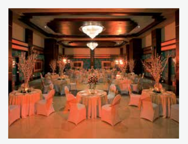
MAKE UP FOR ALL THE ANNIVERSARIES YOU FORGOT AT THE BANQUET HALL.