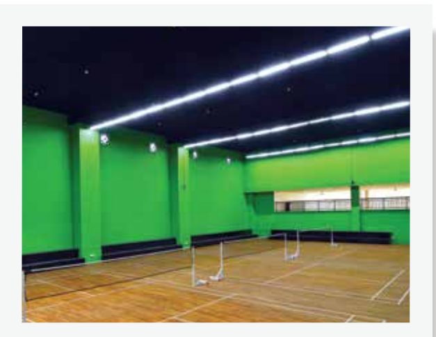
RENEW THOSE LONG FORGOTTEN NEW YEAR RESOLUTIONS AT THE BADMINTON COURT.